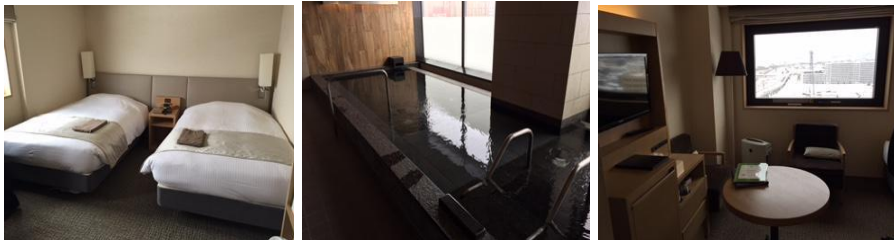
JR Inn Asahikawa- room, public bath, and view from many of the rooms

Besides its location, the hotel offers a public bath for men and women in a semi-outdoor setting, rooms with views of the surrounding countryside, and a direct elevator down to the AEON Mall. There is no need to bundle up as you shop and dine the evening away.