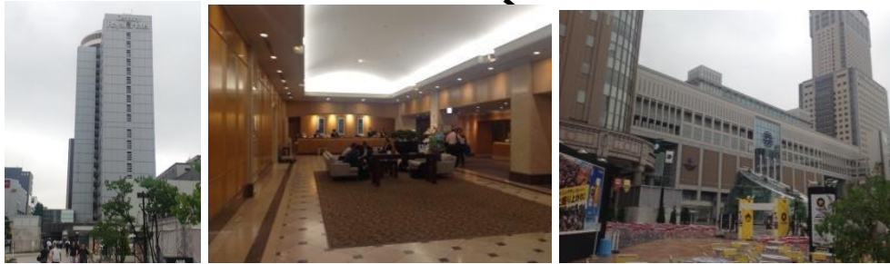
Century Royal Hotel Sapporo

In July, the days are long, locals are out enjoying the daylight that can go up to 10:00pm and various pop-up beer gardens. Sapporo is the perfect city to spend a summer weekend.