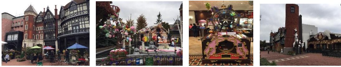
Shiroi Koibito Park

Next, we'll visit Sapporo Central Wholesale Market (Jogai). This market offers some of the freshest fish and produce in Japan. At the "Curb Market," you can find approximately 60 stores selling everything from fruits to seasonal goods. Pick up some fresh crab and salmon sushi, a donburi bowl, or other regional delicacies as you enjoy lunch on your own here.