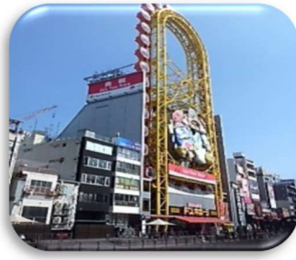
One of two Don Quijote stores