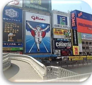
The Famous Runner Neon