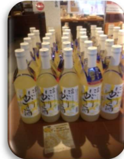
Hakutsuru Sake Brewery Museum