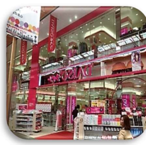
Ever popular Daiso