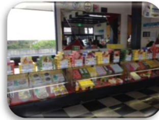
Kasutera (Honey Cake) Factory

Now, on our way to Nagasaki, arriving at our hotel, Hotel New Nagasaki at approximately 4:30pm. After checking in, the remainder of the evening is free. Our hotel is ideally located, just a short walk to the JR Nagasaki Station. You are just steps away from a variety of shopping and dining options.