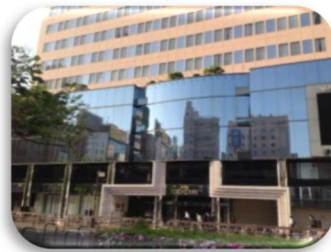
Hotel Clio Court Hakata

If Fukuoka doesn't burst with sights like Tokyo or Kyoto, its friendly atmosphere, warm weather, and contemporary attractions – art, architecture, shopping, and cuisine – make up for it