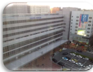
Hakata JR Station