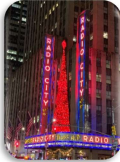
Radio City Music Hall